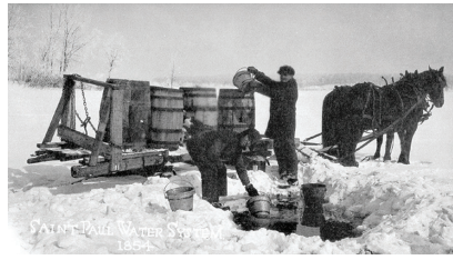
Original Distribution System Circa 1854

Saint Paul Regional Water Services is a not-for-profit entity of the City of Saint Paul governed by the Board of Water Commissioners. It is heir to a legacy of well-developed water sources and a water distribution system that has served the residents of the City of Saint Paul and the surrounding area for nearly 140 years.