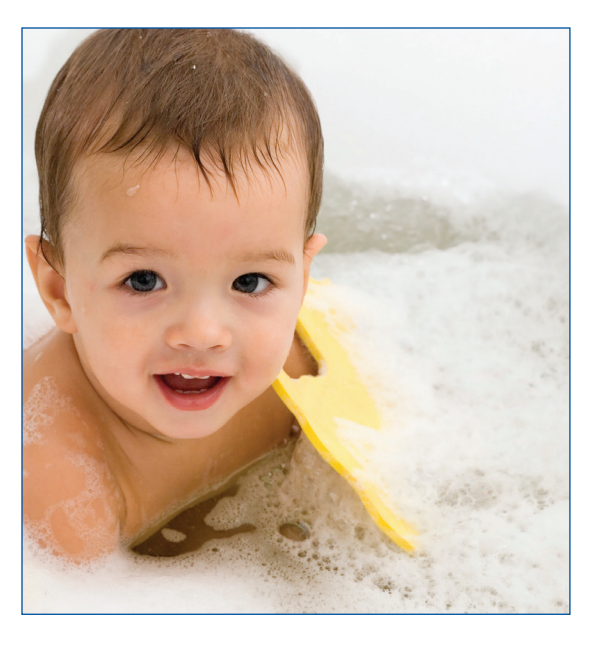
WaterWorks is a Saint Paul Regional Water Services initiative to assist low-income customers with water and sewer costs.

It is administered jointly by SPRWS and Community Action Partnership of Ramsey & Washington Counties. Community Action