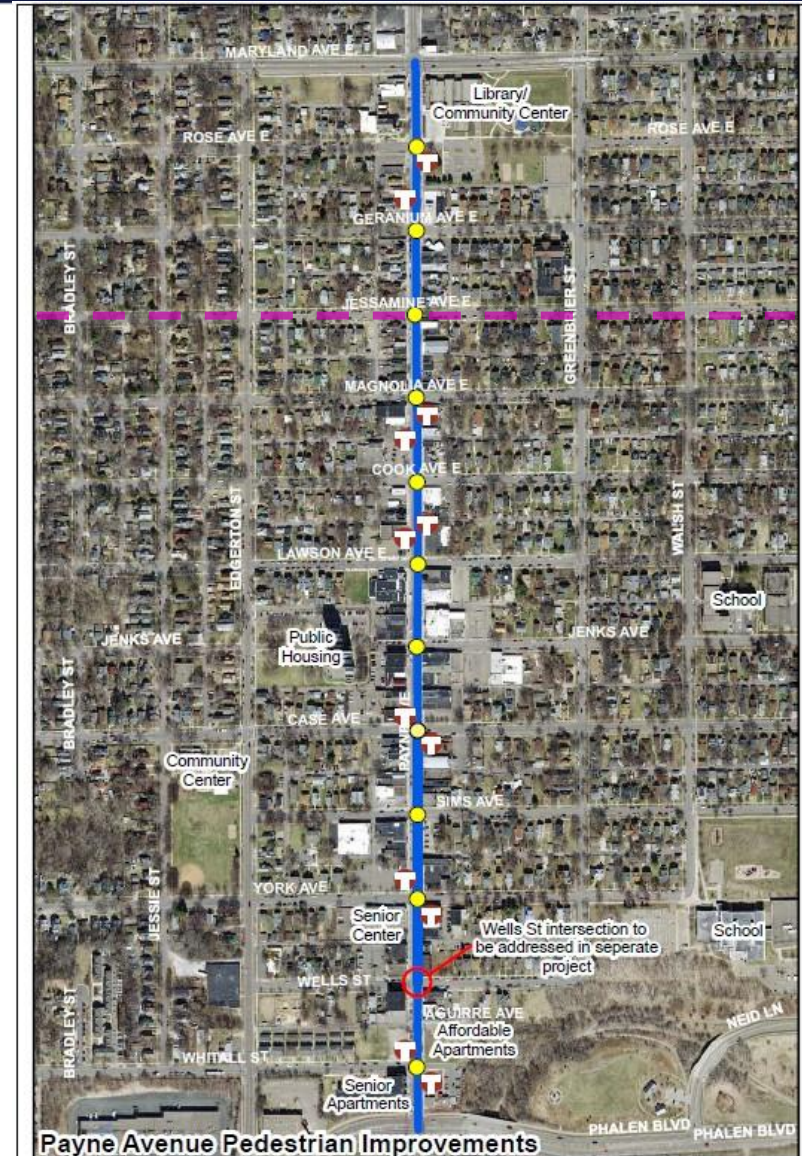
Payne Avenue Pedestrian Improvements